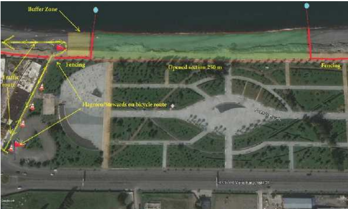
Fig.2. Traffic route map including interference between circulating vehicles and activities on the beach