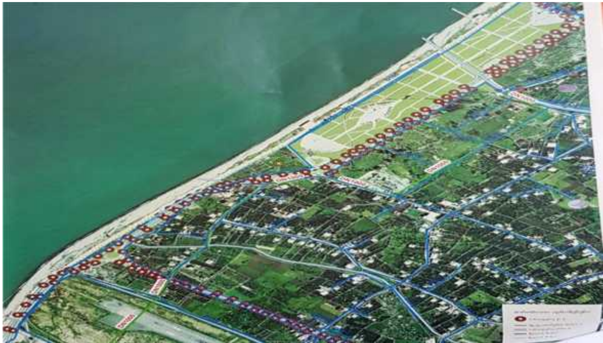
Fig.1. Traffic route map including interference between circulating vehicles and activities on the beach