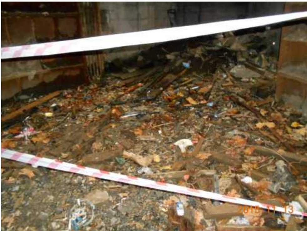
Photograph 6: Details of the area mentioned in the photograph 5.