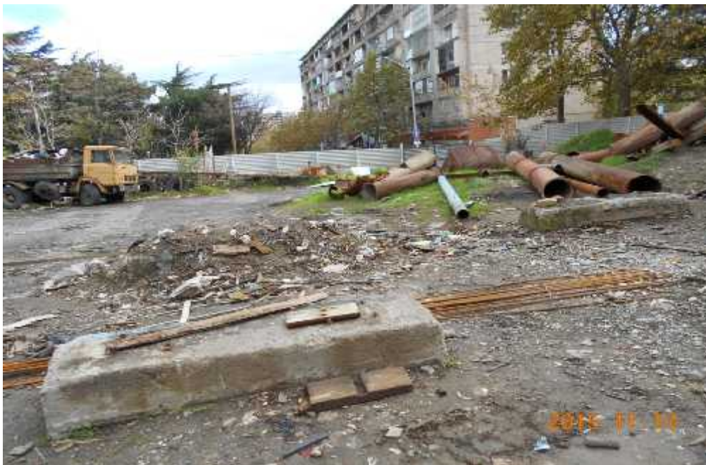
Photograph 2. Area close to the offices that must be cleaned, details of old pipes