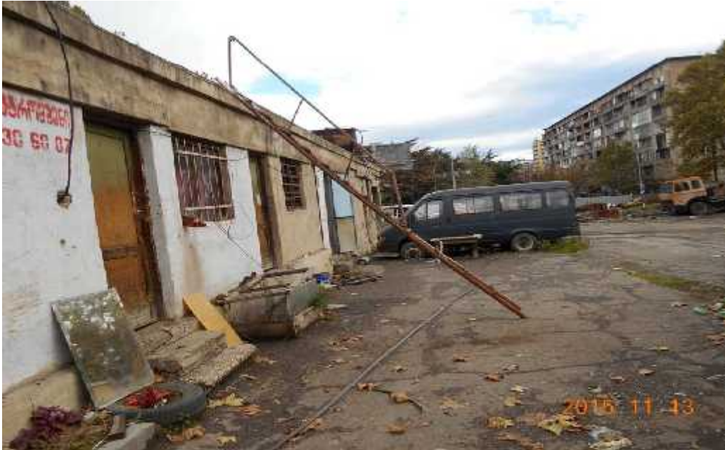
Photograph 1. Area close to the offices that must be cleaned. Details of abandoned vehicles