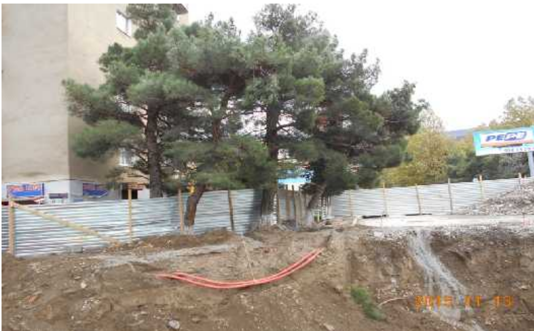
Photograph 8: thress that must be properly protected for not being affected by the execution of the works