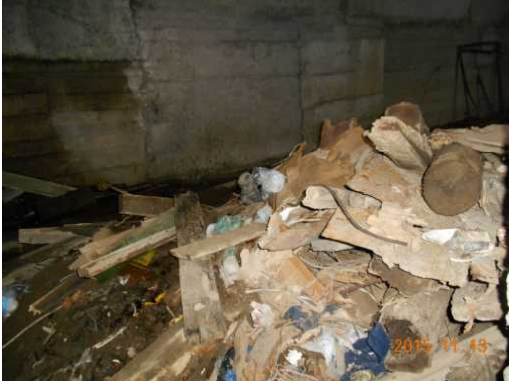
Photograph 5: area behind one of the air duct. There is accumulation of wastes that must be removed.