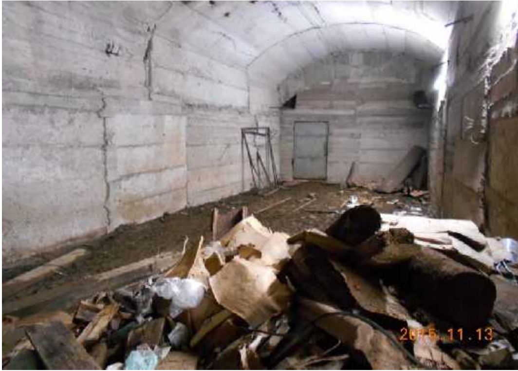
Photograph 9: Area inside the tunnels with rubbish accumulation that must be removed