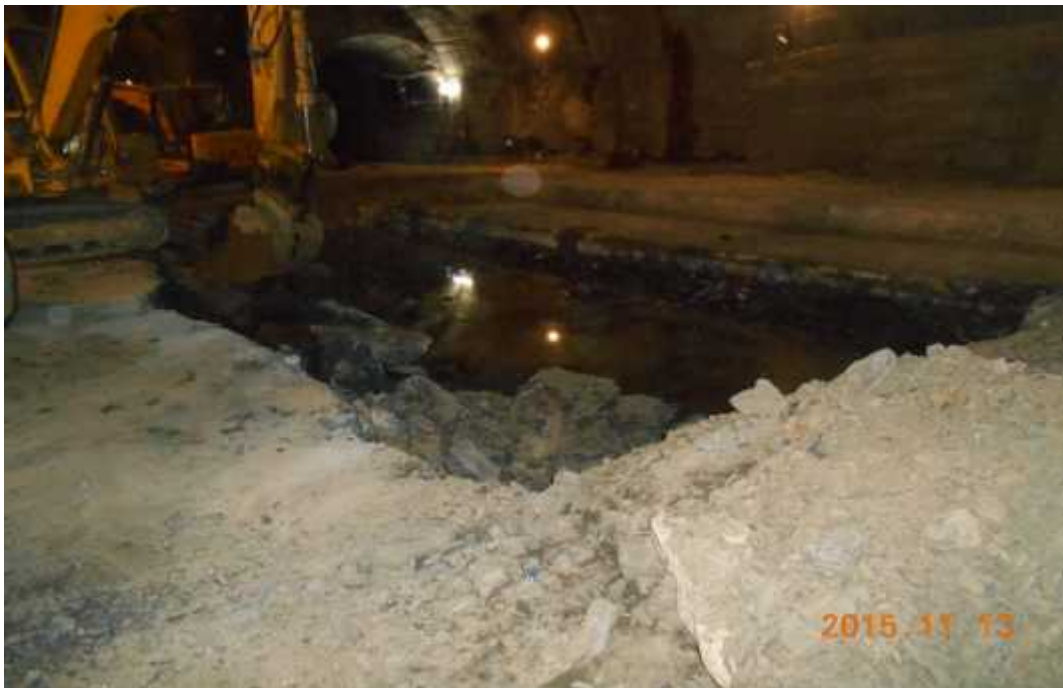
Photograph 4: Area inside the tunnels with zones of water accumulation