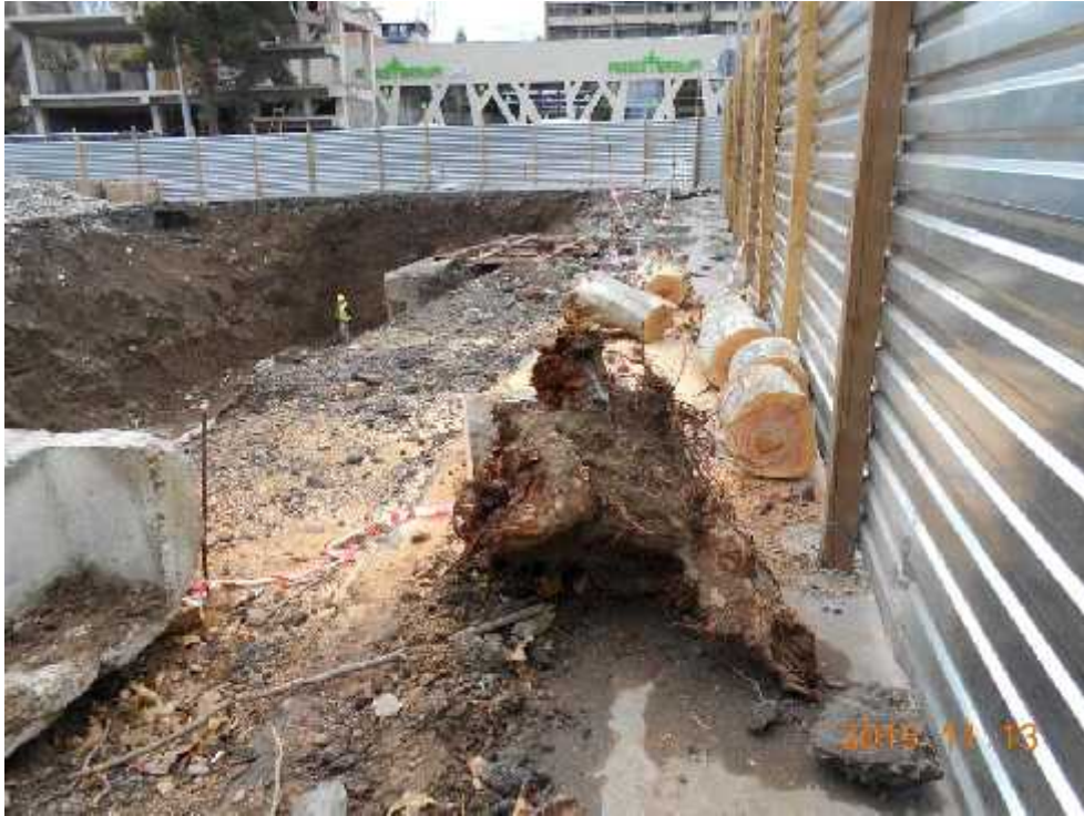
Photograph 3. Cut tree (the permits to do it were processed)