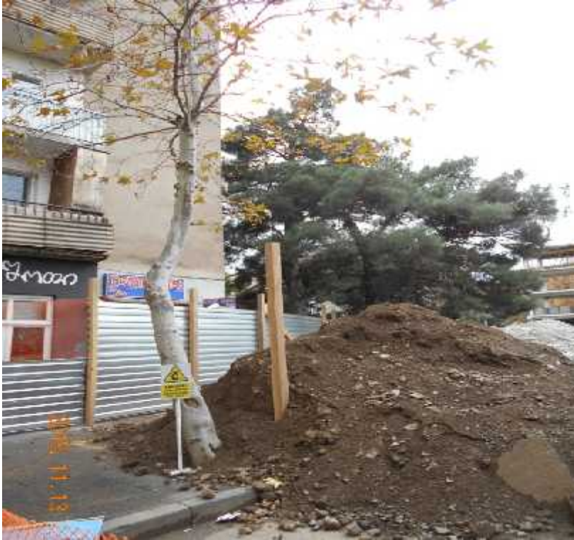
Photograph 7. Three that is going to be affected by the works and shall be cut later on