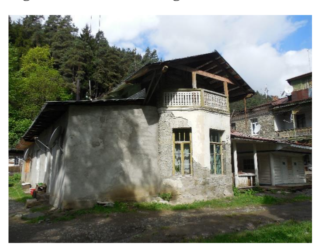
Figures 2 and 3. Building at Rustaveli #64

An example is the building at Rustaveli #64 (Figures 2 and 3). with 5 families living in it.