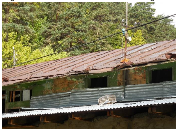
Figure 5. Apartment on the rear façade