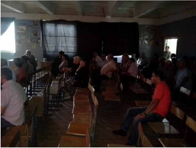
Photo material of Public Consultation Meetings