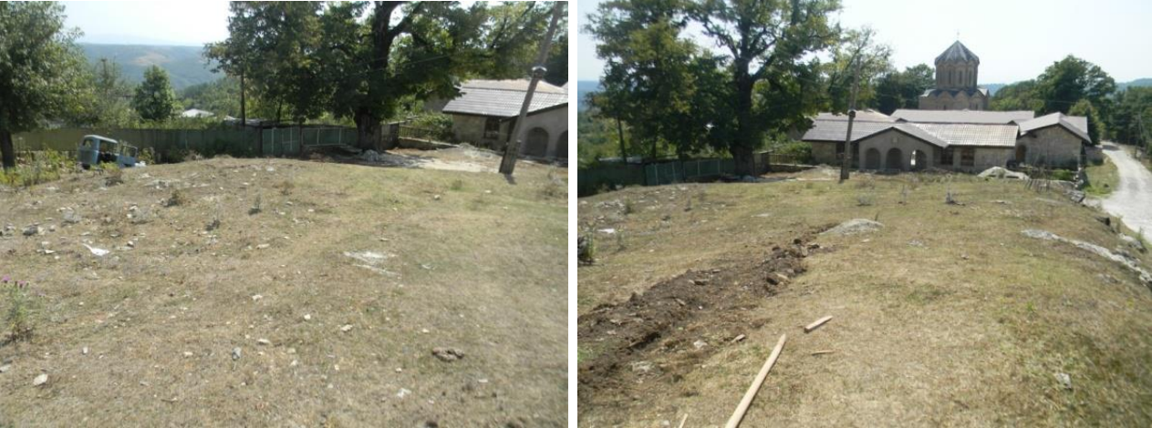
Road to be rehabilitated within the SP