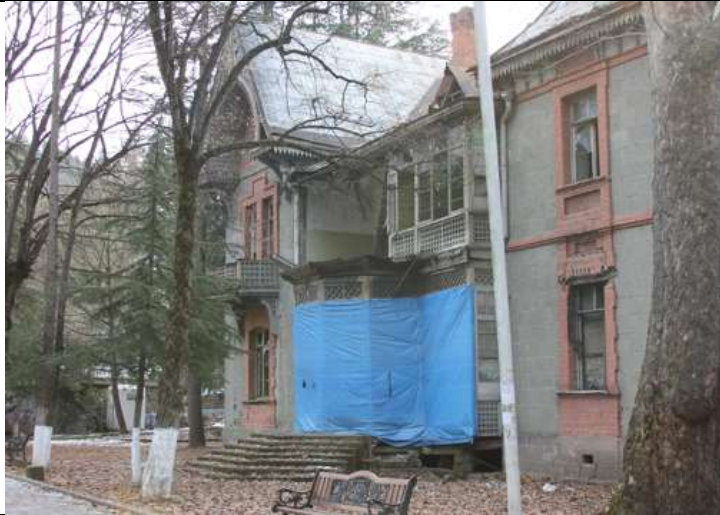
Photomaterial of the existing situation