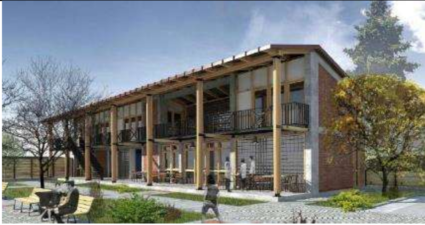
Visitor Center, renders