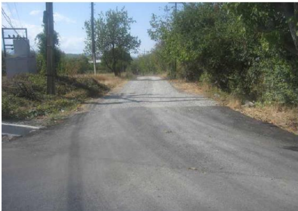
Current condition of the road to be rehabilitated