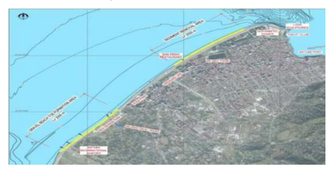
Figure 3. Site Location with GPS

x=41 37.0371'N, γ=41 35.0911'E x=41 37.1117'N, γ=41 35.1117'E x=41 36.5740'N, γ=41 35.0988'E x=31 36.5842'N, γ=41 35.0637'E