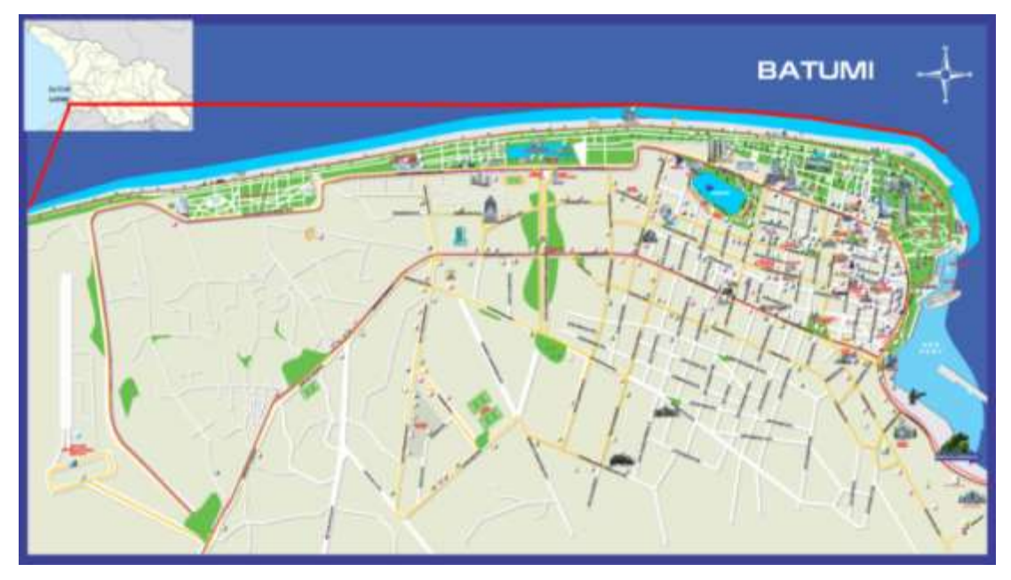
Figure 1: General location