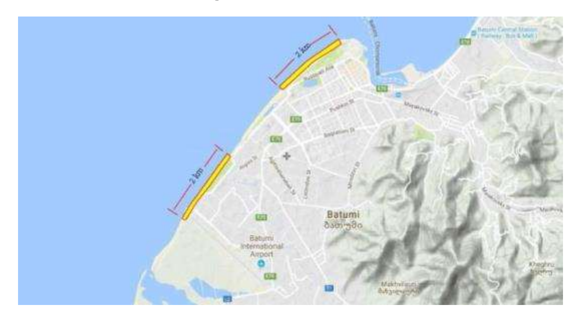
Figure 2. Site location