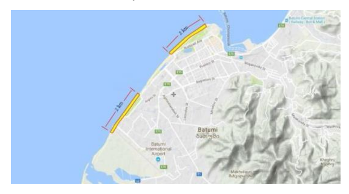
Figure 2. Site location