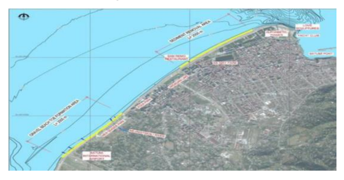
Figure 3. Site Location with GPS

x=41 37.0371'N, y=41 35.0911'E x=41 37.1117'N, y=41 35.1117'E x=41 36.5740'N, y=41 35.0988'E x=31 36.5842'N, y=41 35.0637'E