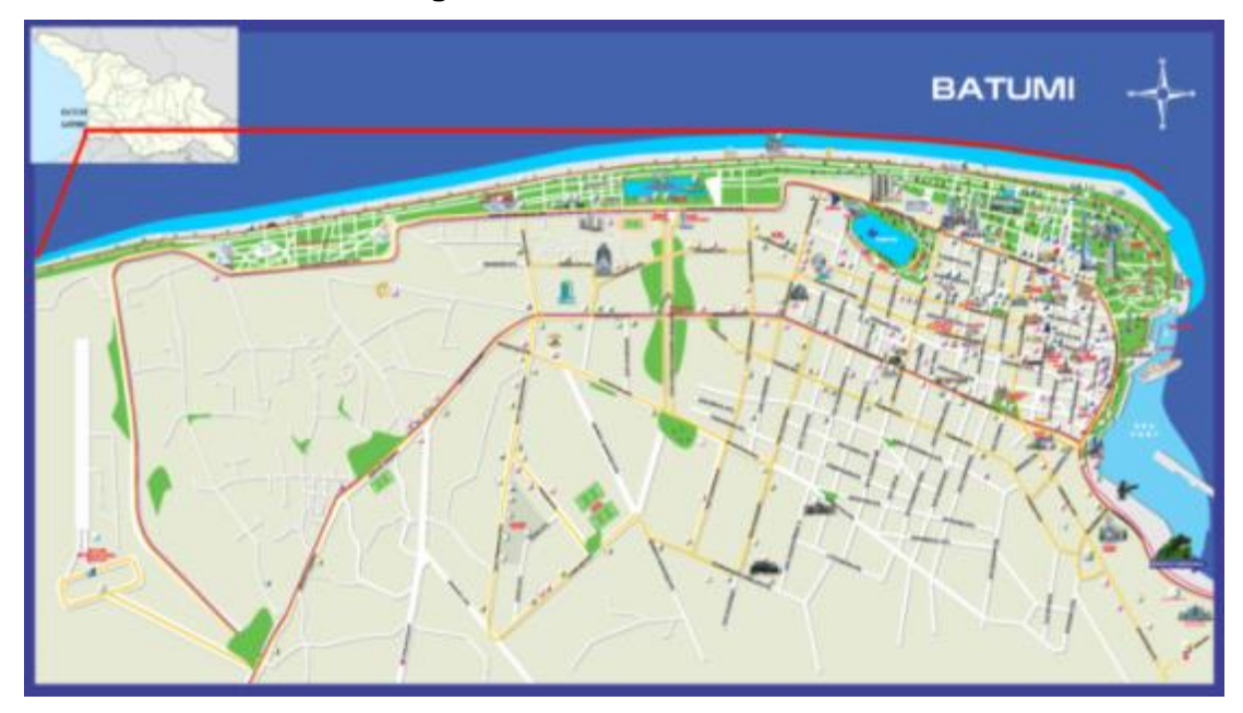
Figure 1: General location