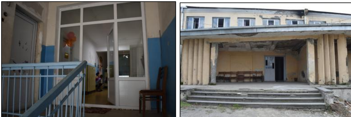
Figure 5. Photos of existing kindergarten

75. Therefore there is increased demand on providing of this public service to local population. No action or a zero alternative implies refusal to the project implementation, therefore the problem related to providing enough places in the kindergartens for local population of village Vardisubani will remain unresolved.