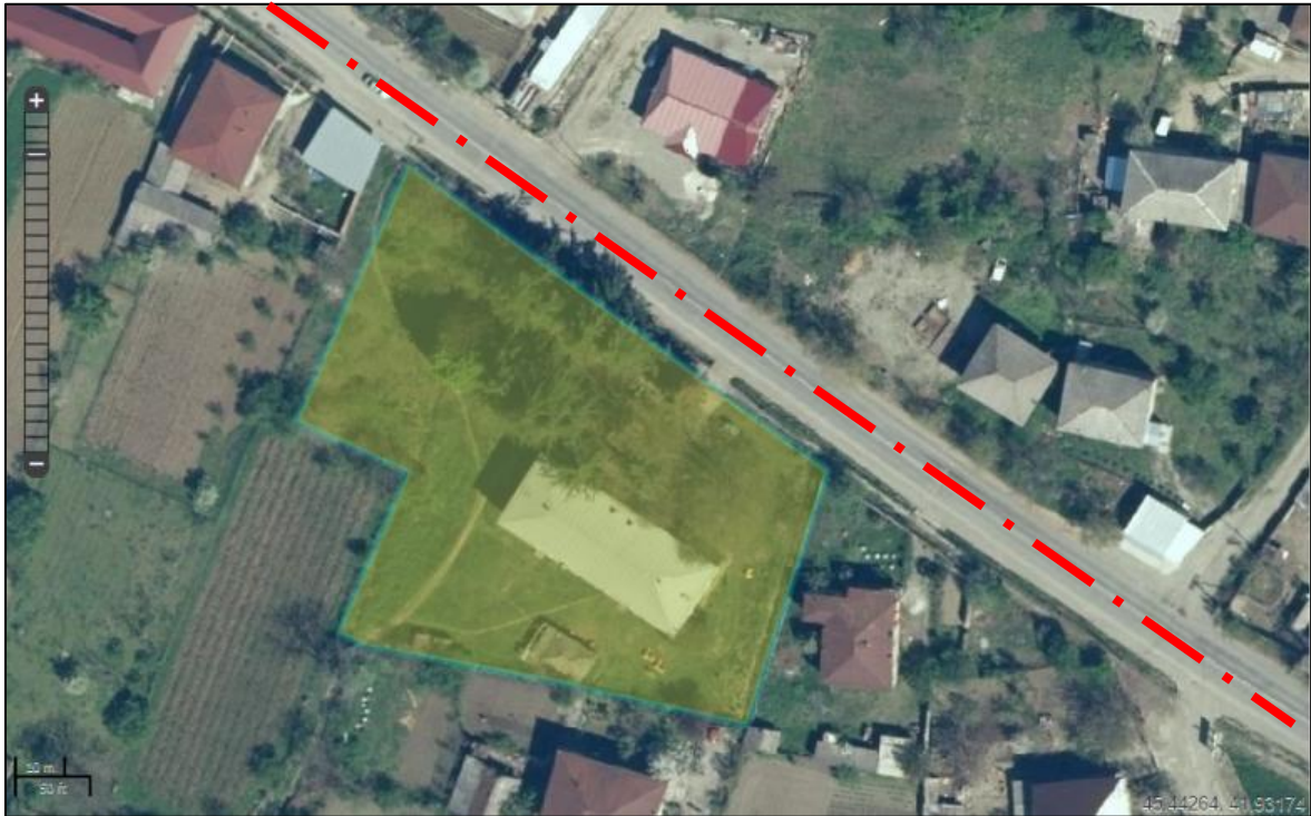
Figure 2 Current state of the project site