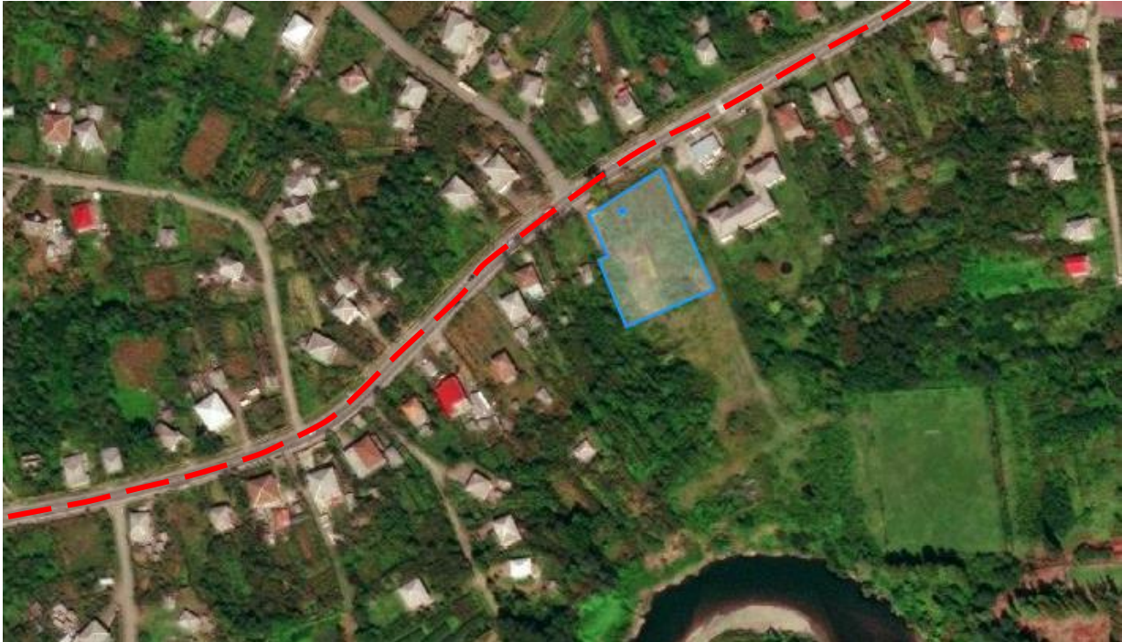
Figure 2 Current state of the project site