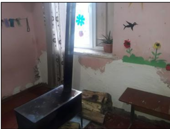
Figure 5. Photos of existing kindergarten building

80. The construction site of the kindergarten was selected taking into account the following circumstance: currently kindergarten for 65 children is situated in the old building built in 1975. The building of kindergarten is in very poor condition and deteriorated.