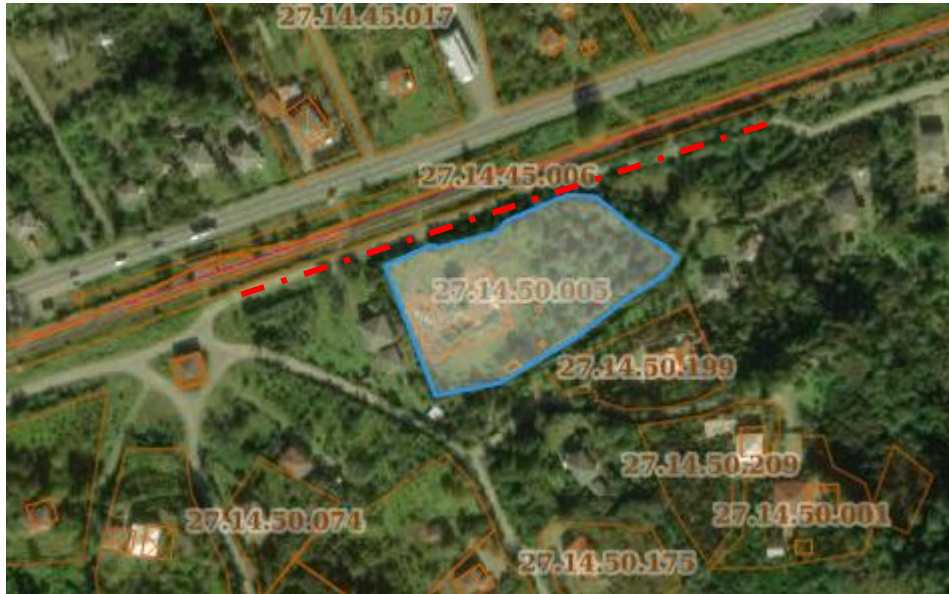
Figure 1 Location of project site and access road