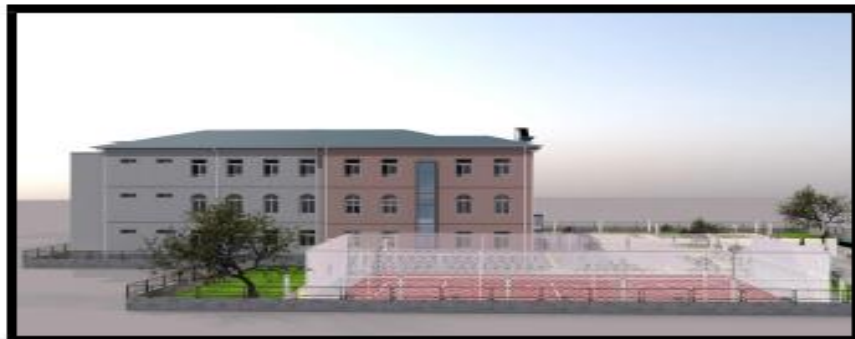
RENDER 7 Page 7