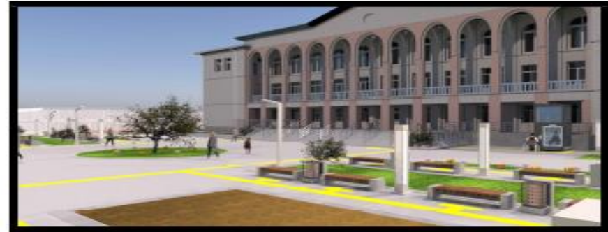
RENDER 6 Page 6