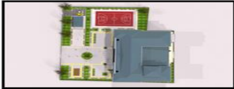
RENDER 1 Page 2