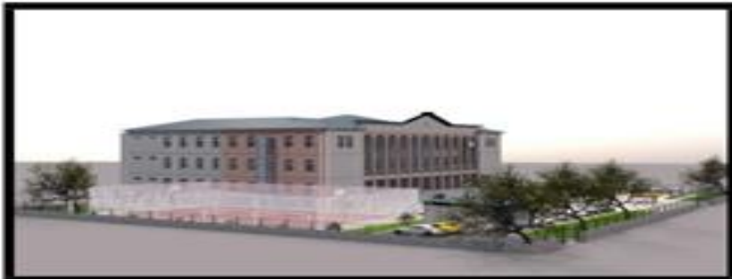
RENDER 3 Page 2