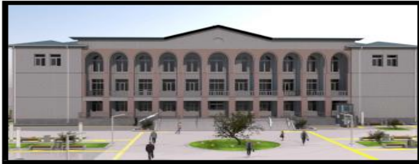
RENDER 5 Page 5