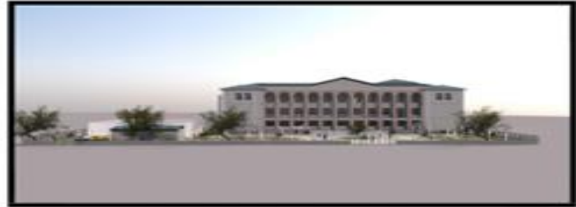
RENDER 2 Page 2