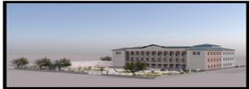
RENDER 4 Page 2