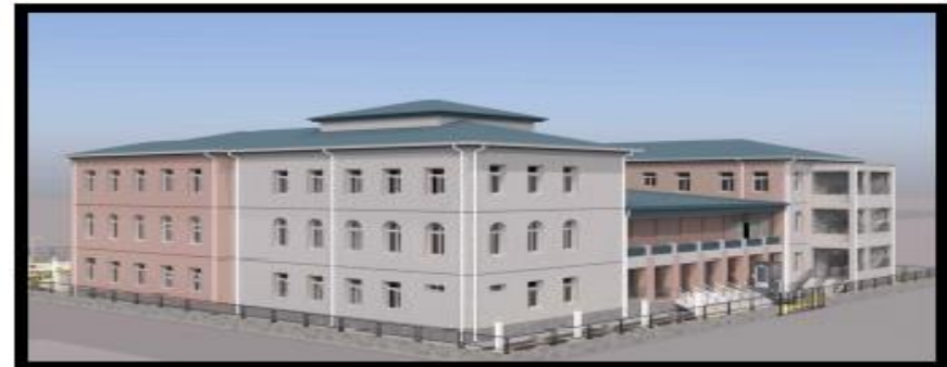
RENDER 8 Page 8