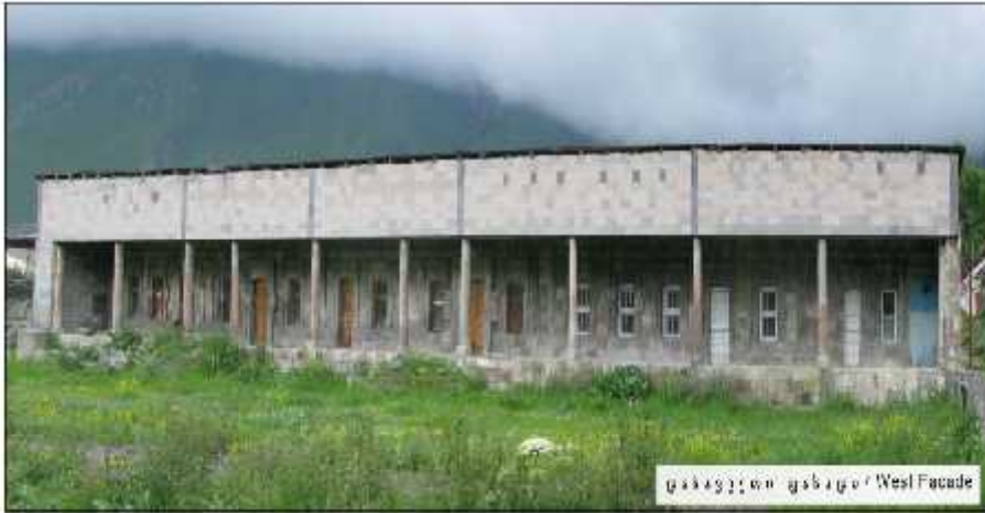
დასავლეთი ფასადი / West Facade