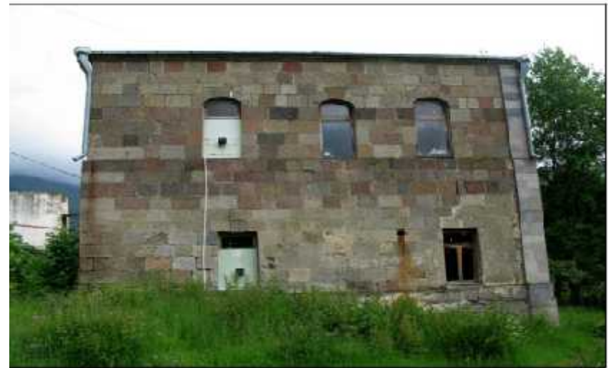
ჩრდილოეთი ფასადი / North Facade