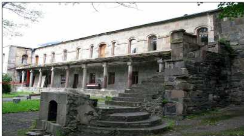
დასავლეთი ფასადი / West Facade