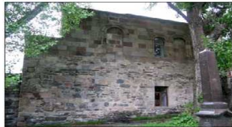
სამხრეთი ფასადი / South Facade