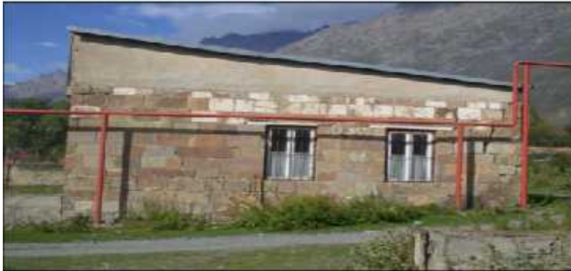
სამხრეთი ფასადი / South Facade