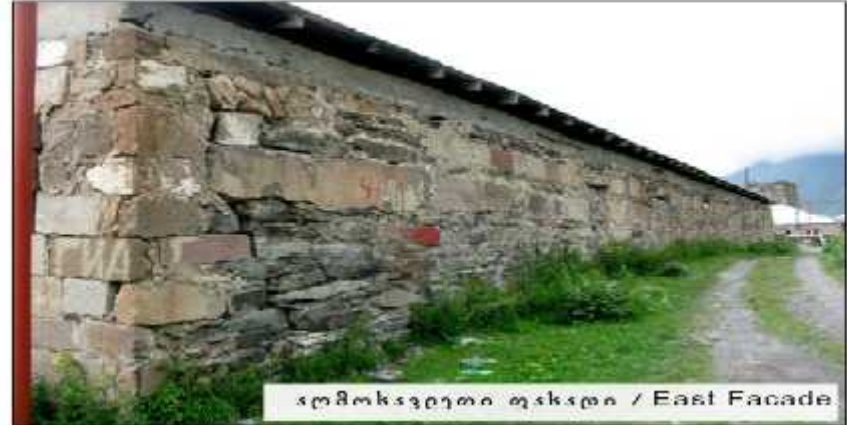
აღმოსავლეთი ფასადი / East Facade