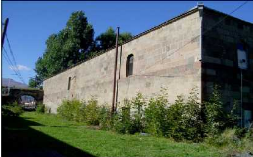
აღმოსავლეთი ფასადი / East Facade